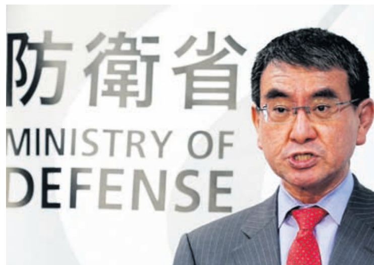
In this Jan. 10, 2020, file photo, Japanese Defense Minister Taro Kono speaks during a press conference at his ministry in Tokyo.